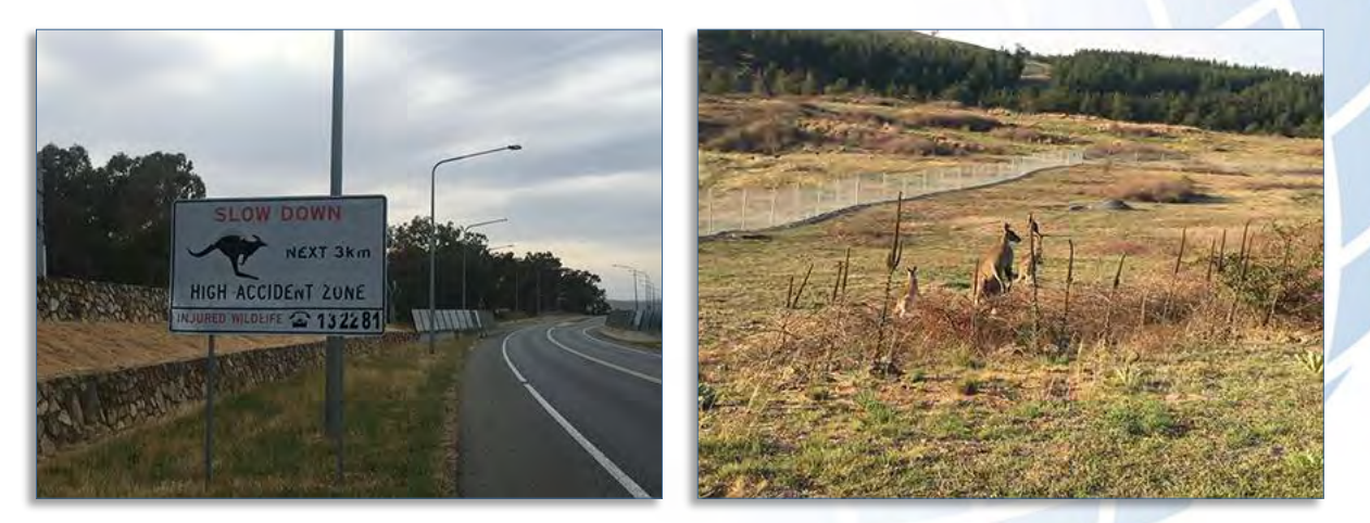
Sure enough, the sign was accurate.

In closing, I hope that you consider the aforementioned benefits and are motivated to get involved. Speaking of motivation, I hope that many of you invested the time to prepare thoughtful, compelling abstracts for the May 2020 workshop in San Antonio, particularly if an accepted abstract is your ticket to the "big dance!" If you have or haven't has the opportunity to attend an annual workshop, I highly suggest you check out the YouTube video on the ICEAA website that includes testimonials from Tampa workshop attendees. Finally, if you are fortunate enough to have your abstract accepted, I highly encourage you to go the extra mile and write a paper. Not only will this qualify you for a coveted best paper award and the accompanying professional recognition, but the process of authoring a paper will be an invaluable learning experience that could set you apart from your peers.