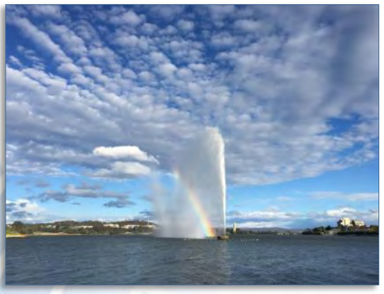
Canberra can be found somewhere behind that rainbow.

G reetings from Canberra, capital of Australia located midway between Sydney and Melbourne and home of the federal government. I mention these details because I was embarrassingly uneducated about this great city prior to my arrival for a five week cost analysis engagement in late October. I've been working my butt off the last four weeks, but have not been too busy to learn that this is a great spot (particularly in springtime!) inhabited by the friendliest people I have ever encountered.