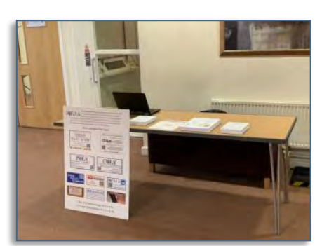
ICEAA's booth at the CAAS Connect Conference, October 2019

In order to achieve my objectives as a chairman of SCAF, I would like to ask your support and encourage all the readers to engage with the SCAF Committee.