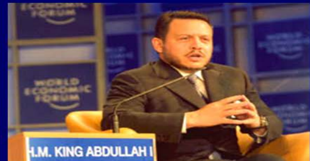
King Abdullah of Jordan