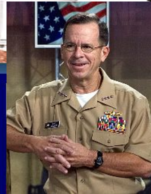
ADM Michael Mullen Chairman, JCS