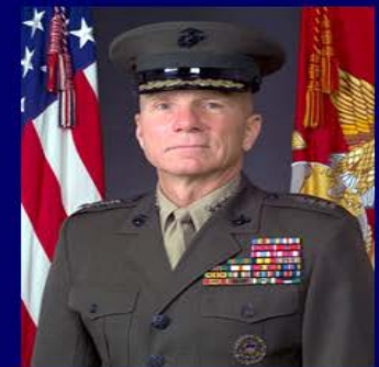
General Michael Hagee Commandant U.S. Marine Corps