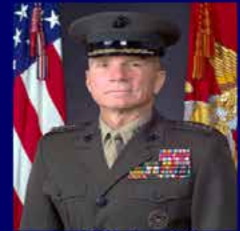
General Michael Hagee Commandant U.S. Marine Corps