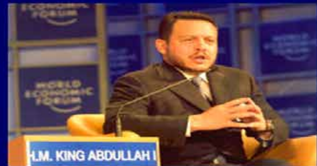
King Abdullah of Jordan