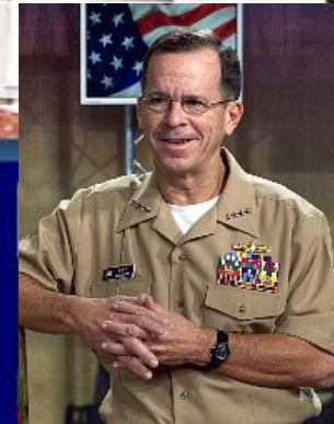
ADM Michael Mullen Chairman, JCS