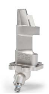
Figure 4 GE 90 Sensor Housing

As 3D printing technology rapidly advances, more and more end use parts are being printed. Commercial airliners now have hundreds of printed parts on each plane. Up until recently that did not include so called “flight critical” parts. It was mainly ductwork, hinges, and brackets. However, General Electric recently received FAA approval to retrofit the cobalt-chrome sensor housing pictured in figure (4) on their GE90 engine which powers the popular Boeing 777. The picture in figure (5) on the right is the fuel injector from the new LEAP engine. It is currently undergoing flight testing. There will be 19 of them on each engine. Although weight