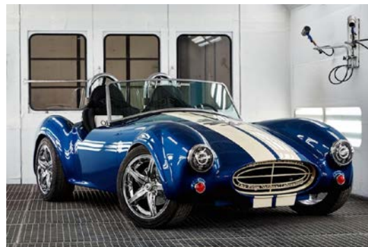
Figure 1 Printed Shelby Cobra by ORNL

Although material extrusion is often used for basic “hobby” level machines, there are some very exciting applications including the Made in Space printer aboard the International Space Station (ISS). Oakridge National Labs (ORNL) used a Cincinnati material extrusion machine called the Big Area Additive Manufacturing (BAAM) machine to print a car body. And some are experimenting with using concrete in extremely large material extrusion machines to print structures.