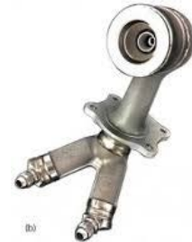
Figure 5 Leap Engine Fuel Injector

saving is a consideration for using A/M for these components, the greater impetus in each case is improved functionality over that which would be possible in T/M components. (7)