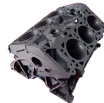
Figure 3 Image courtesy of Weltronics 3D Rapid Prototyping (24)