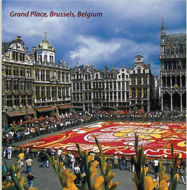
Grand Place, Brussels, Belgium

NATO Air Command and Control System (ACCS) Management Agency