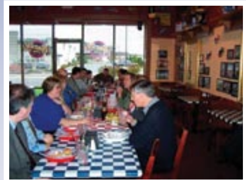
A good time is had by all the Dayton Chapter Networking Luncheon.