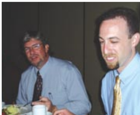
Everyone had a great time at the Fall Seminar!