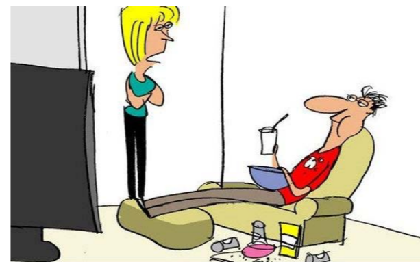
"YOU'RE EITHER NETWORKING OR NOT WORKING."